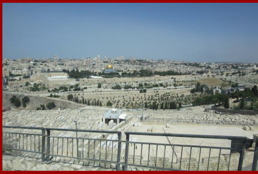
Above: View of Jerusalem from the Mount of Olives with Jewish cemetery in the foreground, walled Old City and the gold Dome of the Rock in the center with El-Aqsa Mosque.