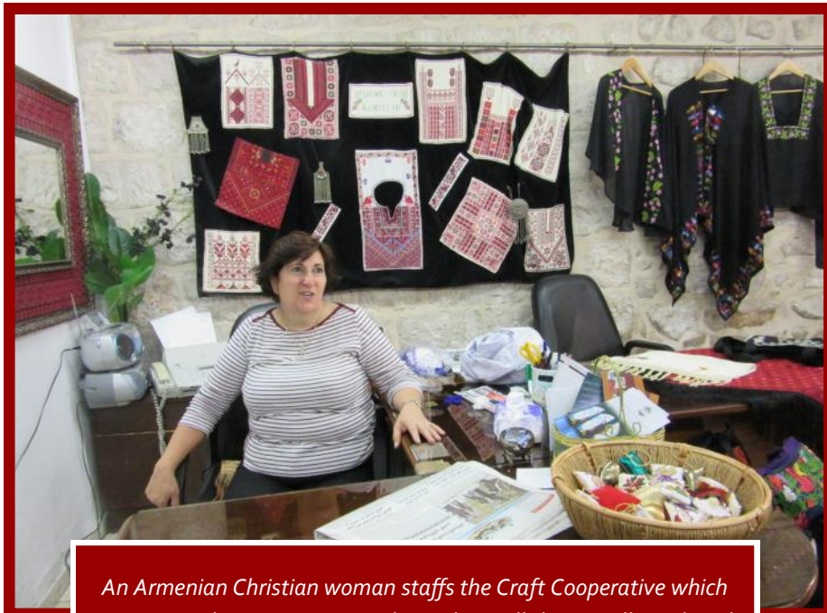
An Armenian Christian woman staffs the Craft Cooperative which supports Palestinian women who wish to sell their needlework and handcrafts through the Cooperative.

Some of us found a Women's Craft Cooperative – not far from our hotel- run by Armenian Christian women where they sold beautiful needlework done by Palestinian women. This helps to provide them with an income stream to put towards the education of their daughters in particular. One good news story, as