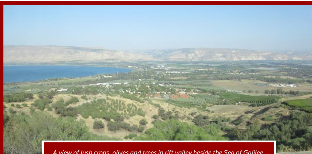
A view of lush crops, olives and trees in rift valley beside the Sea of Galilee. The bus is stopped at sea level and the valley floor is 200m below.

way they know how to cope and their resilience and faith sustains them.